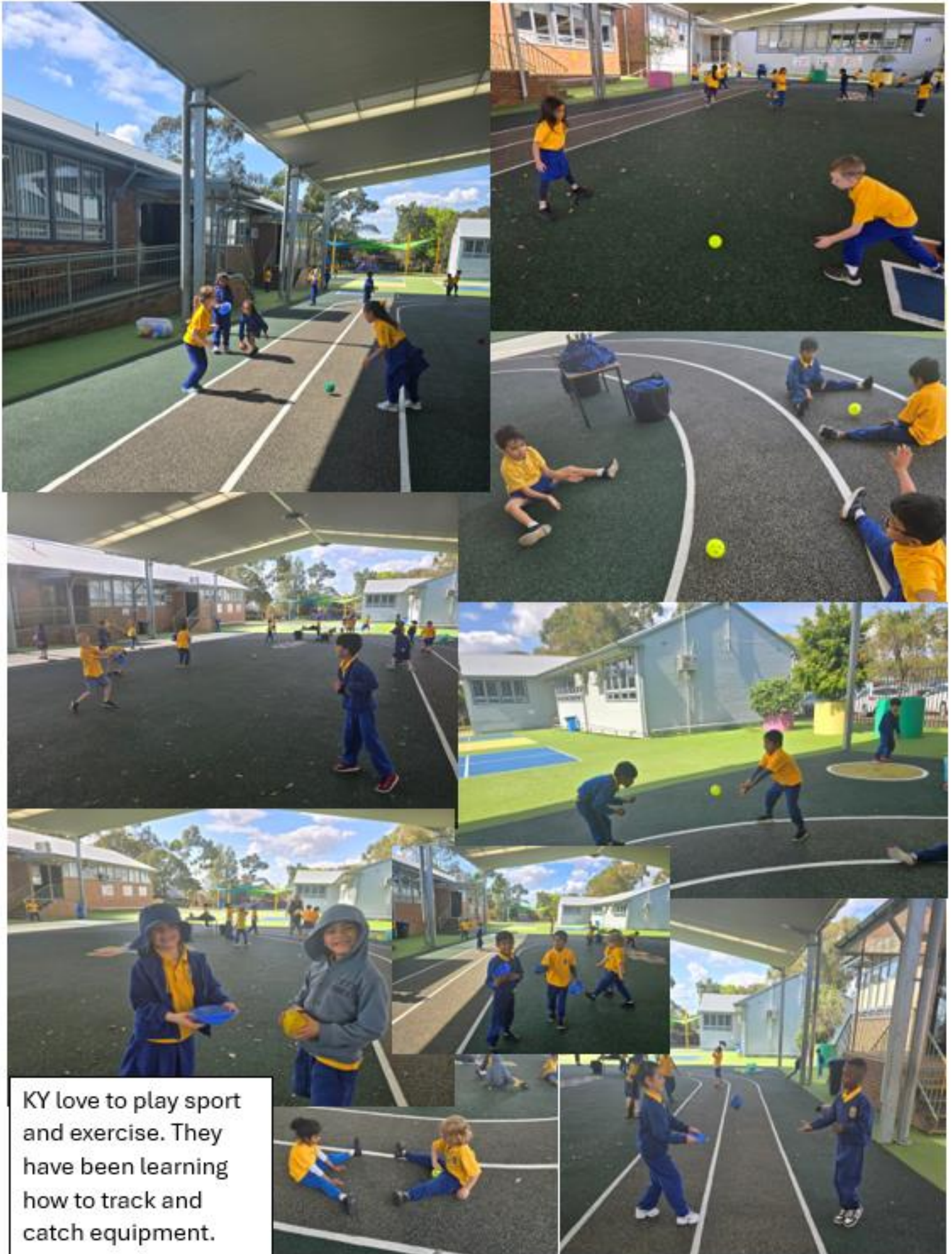
KY love to play sport and exercise. They have been learning how to track and catch equipment.