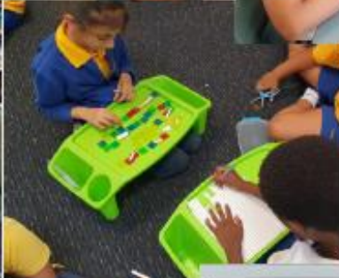
Learning about arrays and multiplication by investigating rectangles.