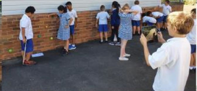
Conducting an experiment to find out which ball has the most elasticity.