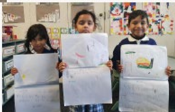
We wrote facts about Australian animals and shared our writing.