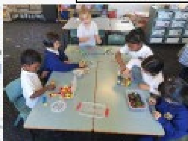
We created repeating patterns using counters, and used a 'copy and paste' feature on an app to create repeating patterns digitally.