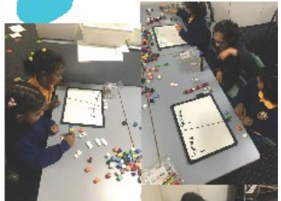
We practised adding together the dots on a domino to build a tower and comparing with a friend to see who had the biggest tower.