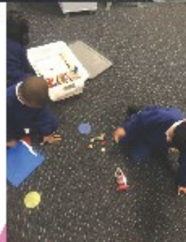
During developmental play we have been working on our fine motor skills and hand strength. This will help us with our writing.