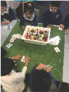
We learnt all about how to make and continue different types of patterns.