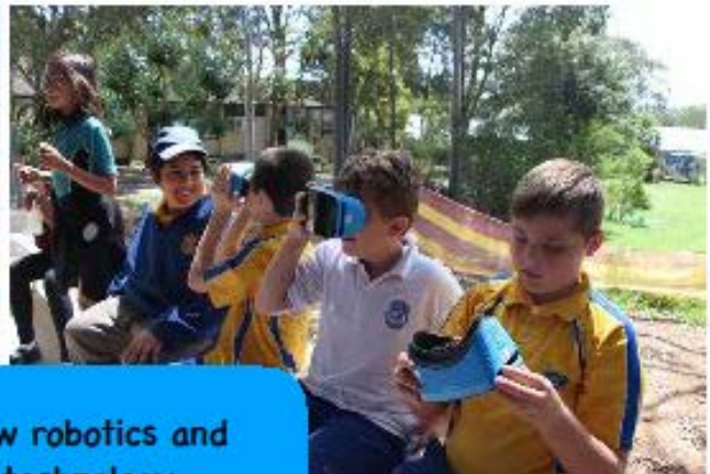
We got to try new robotics and virtual reality technology