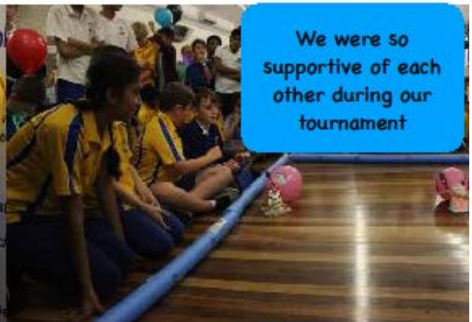
We had to design and build a battle robot with limited resources to pop the balloons of other schools we played against in the tournament