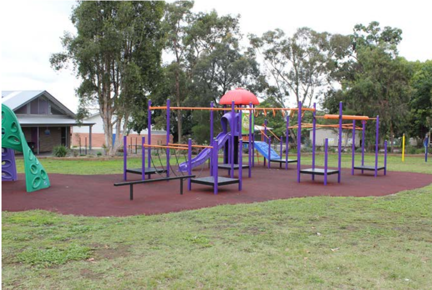
School play equipment

The school enjoys wonderful community support. The Schools as Community Centres was established in 2004. This program targets children and their families in the 0-8 year's age group. Already the program has established ongoing programs such as playgroup, women's support group, zumba classes, as well as sessional programs throughout the year such as parenting programs. A full time facilitator coordinates activities within the school community and can be contacted on: 9896 7514 or by contacting the school on 9631 3737. The SACC rooms are located at the Eastern end of the school in Fuller Street and are available to all school community groups upon request.