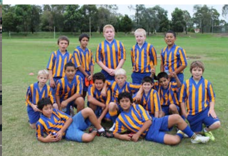
Netball & AFL Teams